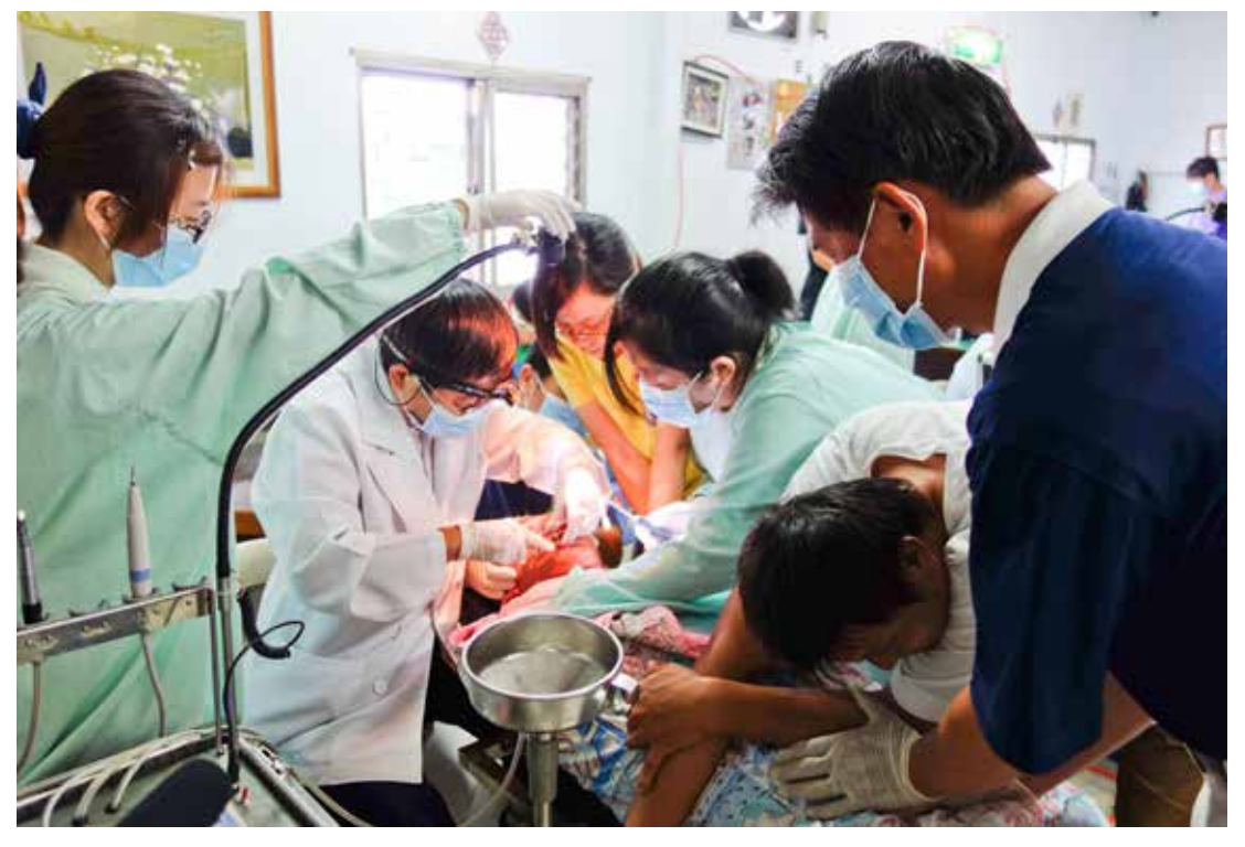
All Tzu Chi volunteers and voluntary Dalin Tzu Chi Hospital staff cooperate to assist the Chia Yi Center residents for dental treatment.