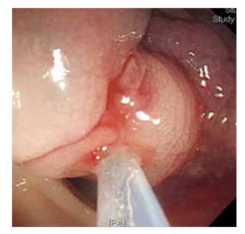
The image shows the appearance of colorectal polyps under a colonoscope during colonoscopy exam. The result shows it as a handle of colorectal polyps' appearance.