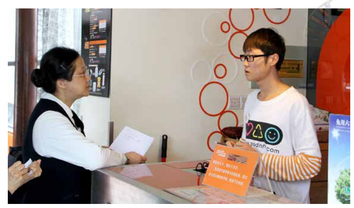
Meeting the youth revealed a story of love by bone marrow donation.

In the winter of 2008, Southern China experienced severe snowstorms. Not just the airport and highways, the train stations were closed. Many passengers were trapped inside airports, while others were forced to travel on foot through the icy storm.