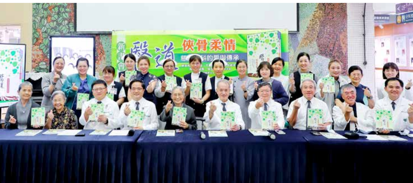
At the book launch, hospital colleagues and Tzu Chi volunteers gather for a group photo and listen to the detailed accounts of the book's protagonists, highlighting the progress and inheritance of medical skills and ethics within the orthopedic team.