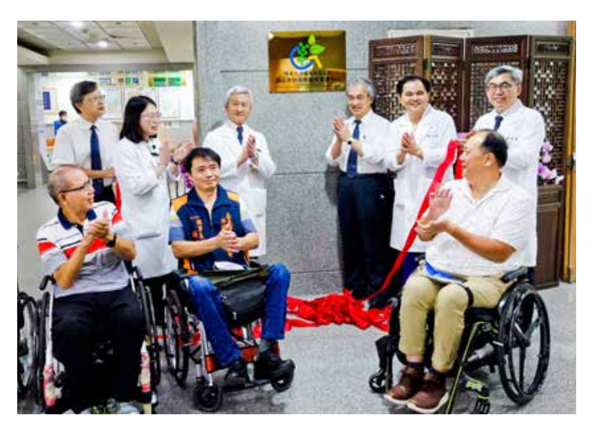
The "Tzu Chi Southern District Spinal Cord Injury Medical Reconstruction Center" commenced on Sep. 16, 2023 at Dalin Tzu Chi Hospital.