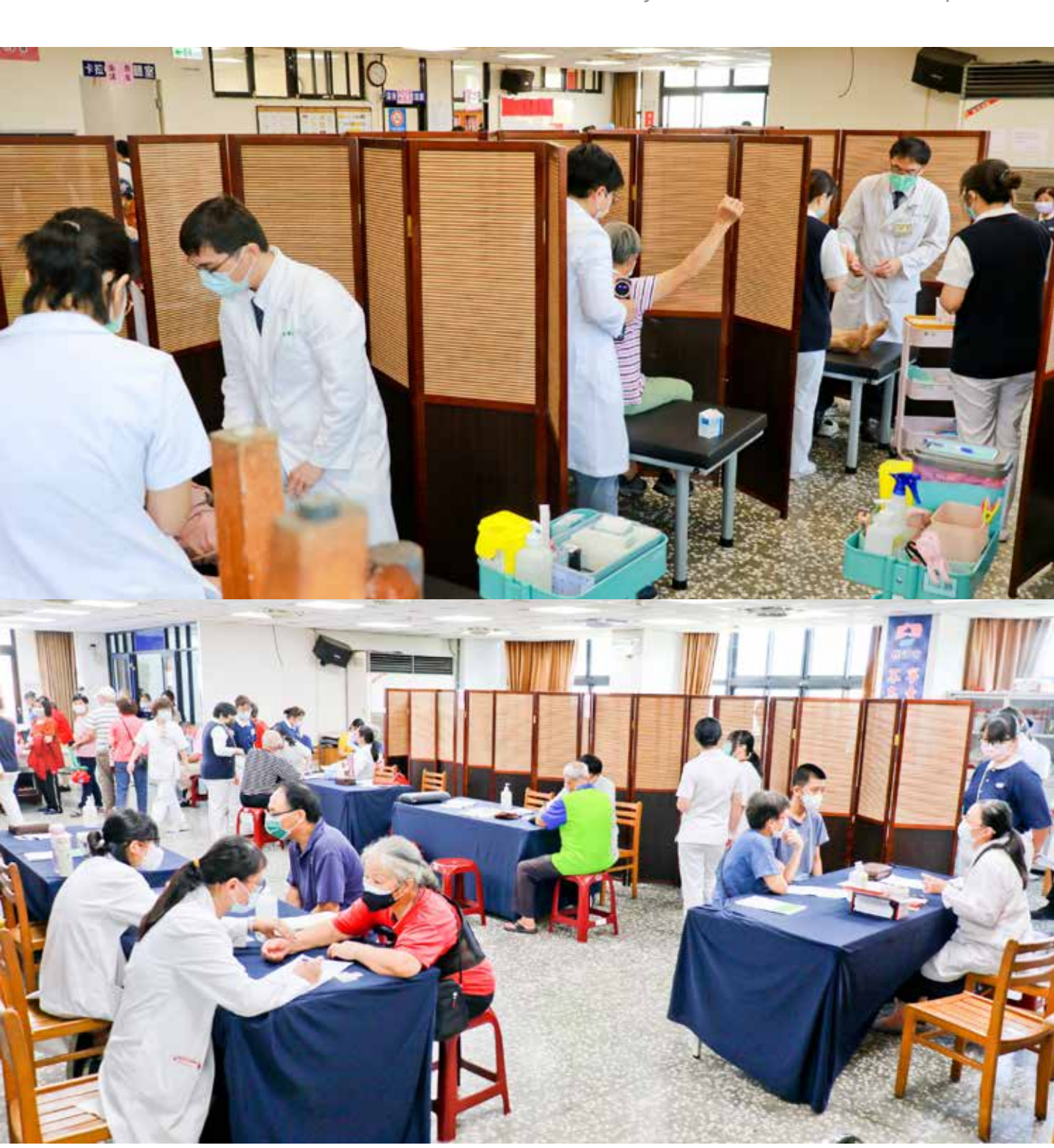
On September 18, a medical team composed of members of the Departments of Chinese Medicine of the Dalin and Taichung Tzu Chi Hospitals conducted voluntary consultations involving pulse taking, symptom inquiry, and acupuncture treatments on a large scale in the Sanyi Township Library.