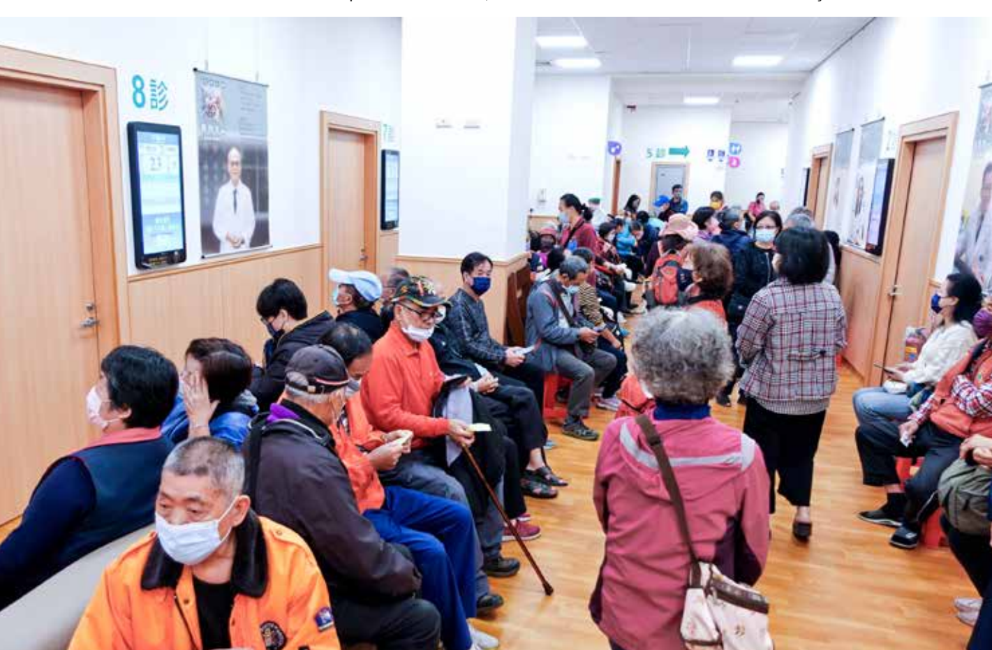
Close to 200 local residents take advantage of free consultation services on December 7, the third day of the pre-launch voluntary consultation event.

"Good morning" in the local Hakka dialect could be heard everywhere.