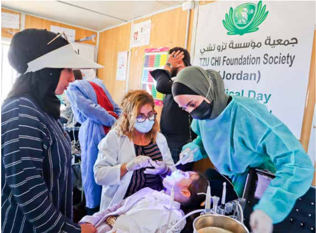
Medical and dental equipment are in full display during the free dental fair.

of the continuing pandemic, so he set up a training program for community volunteers.