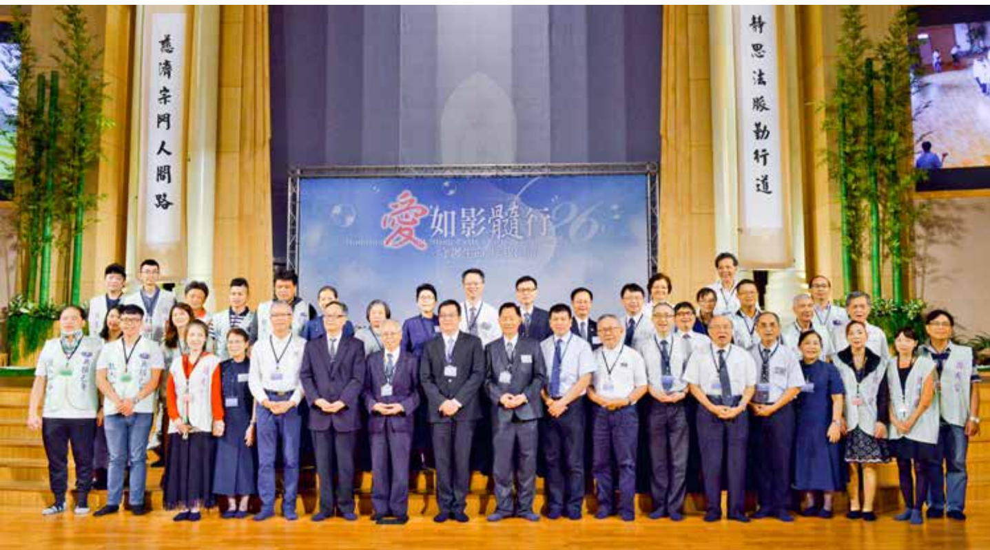
The 2019 reunion of the Buddhist Tzu Chi Stem Cells Center was held in the Jingsi Hall in Taichung. Eight donor and donee pairs participated, and representatives from each hospital also arrived to witness the miracle of life.

and donee) at the reunion. People came from as far as Liaoning Province (China); and the ages of the participants ranged between twenty-five and sixty-five. One donor postponed plan to bear child, some dedicated to their family members who suffered from leukemia, while others simply wanted to make a difference. A patient who successfully paired with another person's similar genetic makeup and regaining life thereafter is truly one of humanity's most beautiful miracle.