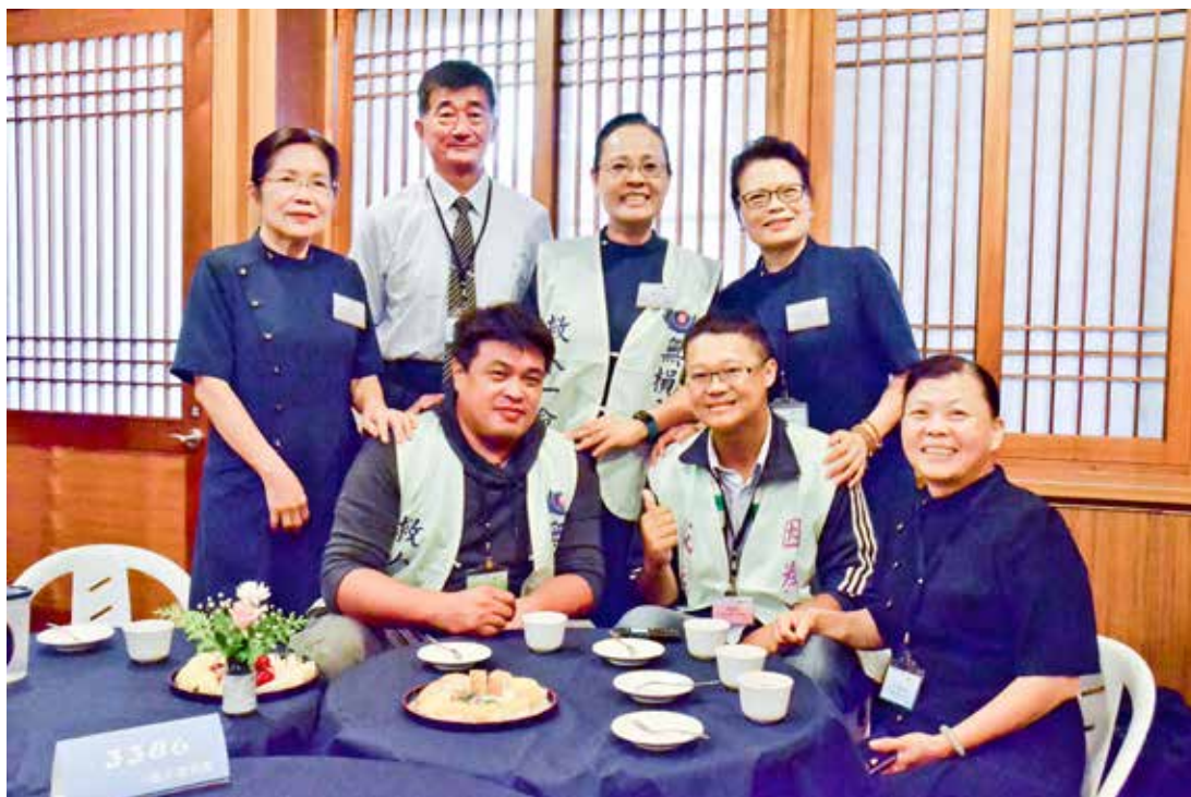
The volunteers involved in the donations were also at the reunion, enjoying the moment that new lives were made.