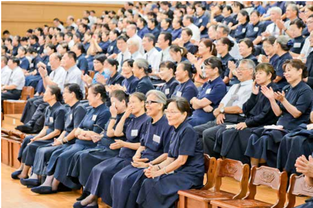
The reunion of donors and recipients brought out tears of joy in the volunteers.