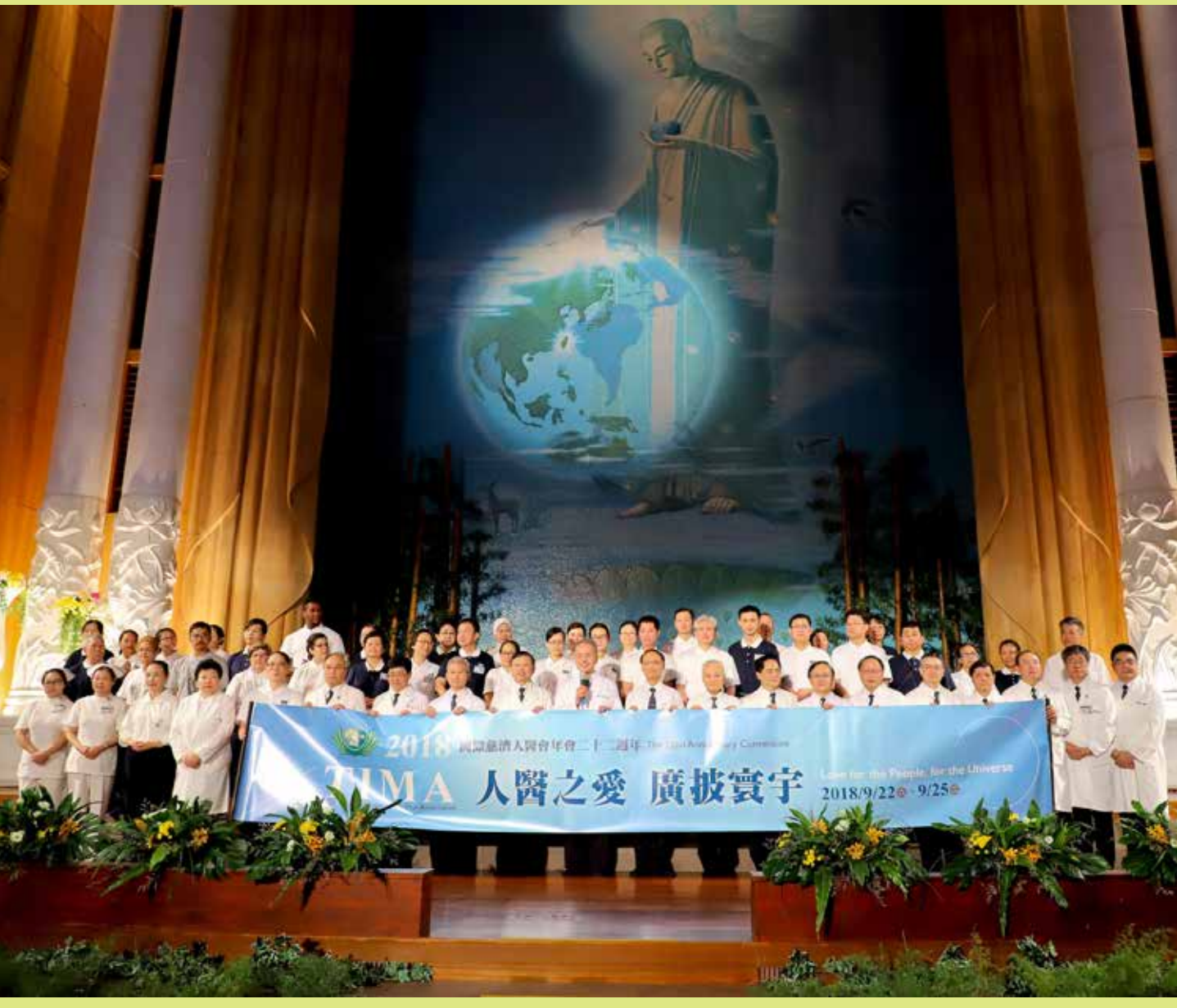
The opening ceremony of 2018 TIMA Annual Convention took place on Sept. 22 in Hualien.