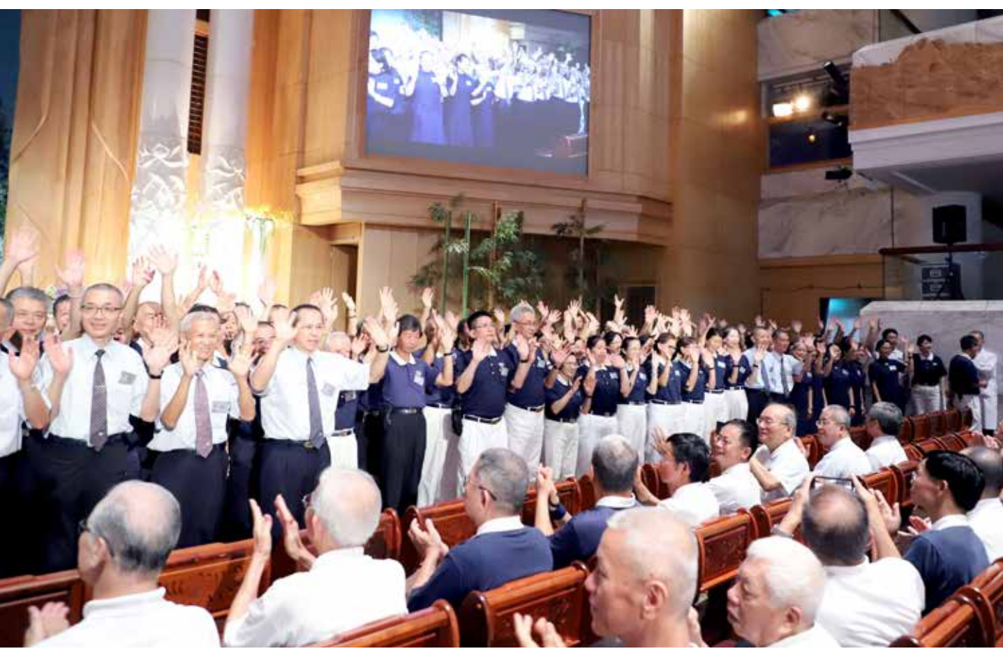
The volunteers from each group went on the stage to greet the participants.

only heal patients, but also protect the earth as well as to safeguard the ecology. Therefore, in addition to the medical, surgical, Chinese medicine, dentistry, nursing, medicine project seminars and sub-disciplinary sessions, this year, Dalin Tzu Chi Hospital's academic team further coordinate the agenda to include the keynote speeches by the international professionals to disseminate issues such as vegetable diet, protecting environment, and commitment to love and respect