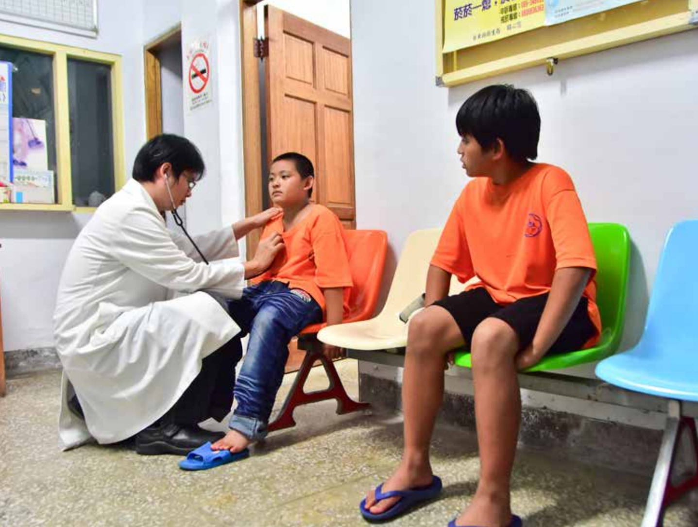
The Hu brothers, still in elementary school, had flu and cough. After measuring their weight and monitored their ear temperature, the brothers answered every question the doctor asked.

station as a token of gratitude for the care they had given over the years. The drink warmed the team's stomach and revitalized their energy.