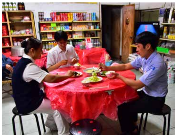
On the eve of Oct. 18, 2016, the team had a brief meal in a grocery store in Lidao before continuing their service.