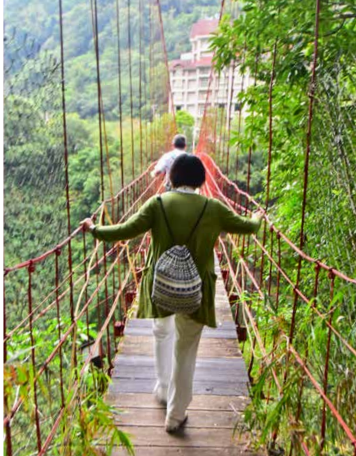
Tianlong suspension bridge.

Signs of the typhoon and its might were still visible along the southern cross-island highway - debris that blanketed the road, and numerous streams of waterfalls were pouring down from the mountainside.