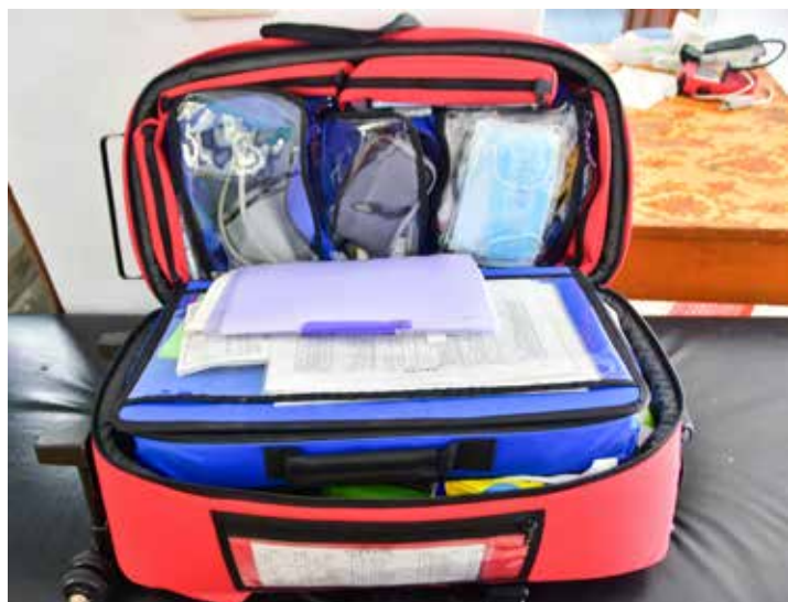
The outreach medical packs carry supplies that are indispensable in safeguarding the villagers' health.

In terms of team composition, under the nursing department are “emergency”, “ward affair”, and “public health; and “public health” can be further divided into “outpatient clinic (general affair)” and “community (home care)”. There are 13 registered nurses under “outpatient clinic”, and some would support the medical outreach every Tuesday; there are five registered nurses under “community”, and some would conduct home visits to patients