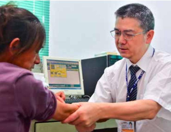
Wearing a gleaming silver eyeglasses frame, with few strands of white hair amid the black, the gentleman-looking Dr. Chang Chih-Fang has an attaching sentiment to the tribal settlements.