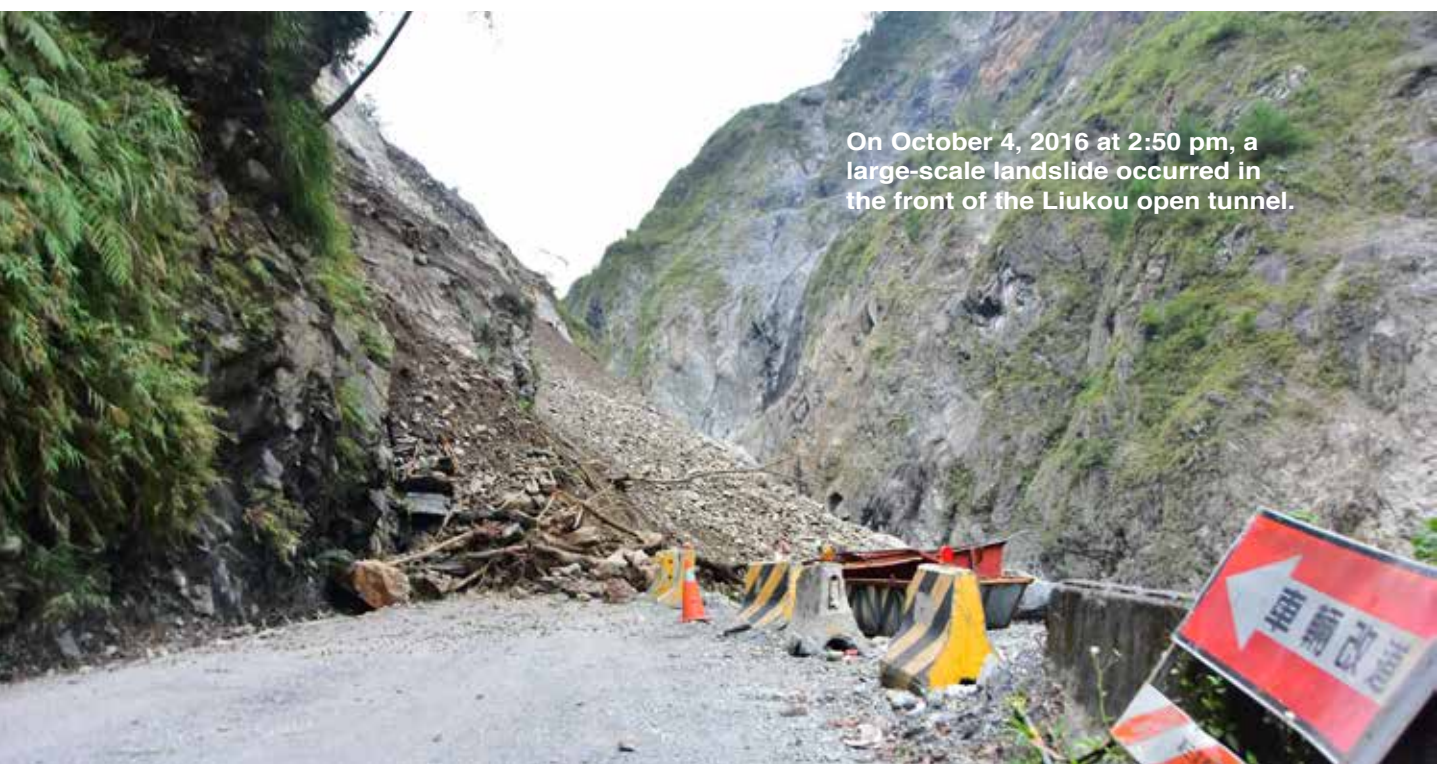
On October 4, 2016 at 2:50 pm, a large-scale landslide occurred in the front of the Liukou open tunnel.

“While working at the hospital outpatient clinic, if we notice patients from the mountainside and had to wait for a while to see reports or dress wounds, we will place them further forward in queue so