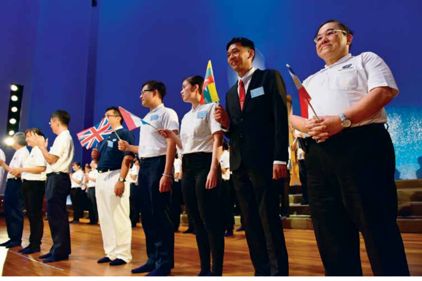
Representatives from the 12 countries waved their respective national flags to greet the audience.

Tzu Chi International Medical Association (TIMA) was officially established in 1998. It is an organized global medical service network, with the vision of "treating illnesses, curing people and healing minds" and making medical care more accessible to the sick and needy. In addition to the TIMA Convention, which is held annually in Taiwan, a TIMA Conference with English as the medium was initiated in 2015. The purpose of organizing the annual TIMA Conference, which is hosted by TIMA members worldwide in their respective country of residence on a rotational basis, is to introduce Tzu Chi's humanistic medicine approach to the local healthcare professionals.