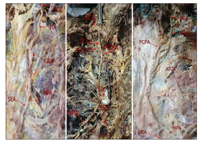
Figure 2: Termination levels for the internal thoracic artery. Left image internal thoracic artery terminating in fourth space; center image internal thoracic artery terminating in 5th space; right image internal thoracic artery terminating in the seventh space. Str: Sternum, SCA: Subclavian artery, ITA: Internal thoracic artery, AICA: Anterior intercostals artery, MPA: Musculophrenic artery, SEA: Superior epigastric artery