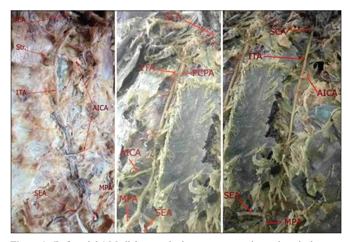
Figure 1: (Left to right) Medial concavity in course, tortuosity, and vertical course of internal thoracic artery. SCA: Subclavian artery, ITA: Internal thoracic artery, AICA: Anterior intercostals artery, MPA: Musculophrenic artery, SEA: Superior epigastric artery

As evident from the findings of this study, it is imperative for the clinician to have knowledge of the peculiar morphological and morphometric characteristics for the internal thoracic artery in local populations. The fact is that internal thoracic artery has become the primary conduit for cardiac bypass surgery; many studies have generated fundamental anatomical knowledge for its clinical utilization, which is useful to avoid intraoperative and postoperative complications [17]. Because of their position, they are often