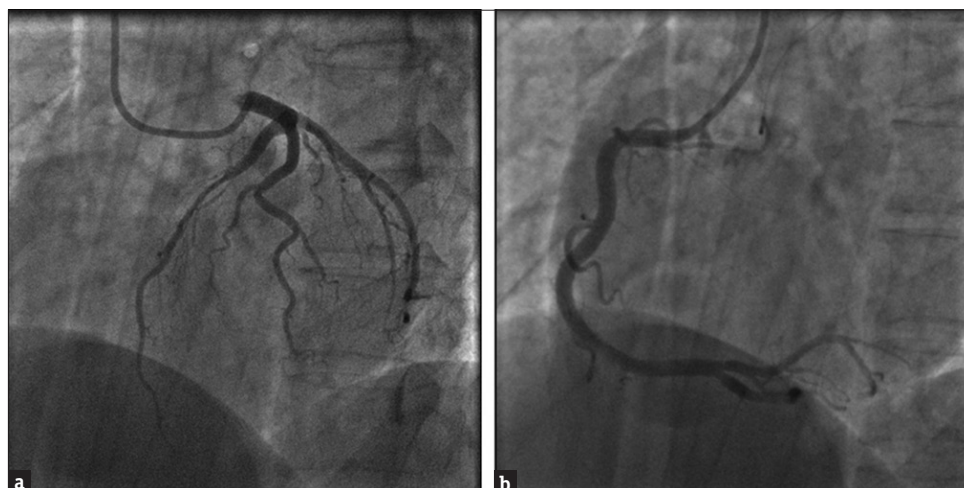
Figure 2: (a) Kimny guiding catheter for engagement of the left coronary artery and (b) for engagement of the right coronary artery