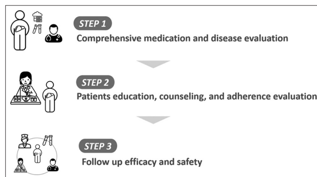
Figure 1: A multidisciplinary team-based model of care to manage hepatitis C virus patients on direct acting antiviral therapy

Before the first dose of a DAA, pharmacists provide medication counseling to patients, including educating them on the importance of adherence, checking for other comedications (including herbs and dietary supplements), and making sure patients are aware of the medication reconciliation