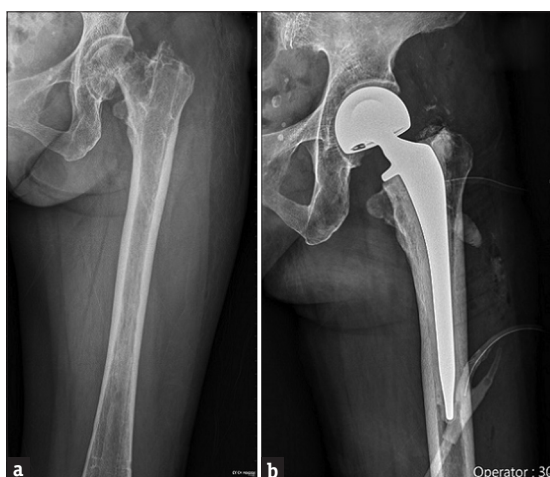
Figure 3: Left femoral fracture before (a) and after (b) the operation. Left ipsilateral subcapital femoral neck fracture was found (a) 5 days after implants removal, and cemented bipolar hemiarthroplasty was done (b) afterward

and decreased failure strength of the neck after implant removal [5]. Among these fractures, subcapital femoral neck