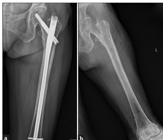
Figure 2: (a) Left femur union before the removal of implants. (b) Left femur after the removal of implants