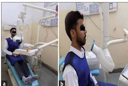
Figure 1: Intraoral radiograph by paralleling technique using care stream 2100CS dental X-ray machine

In the present study, diabetes group patients when compared to controls showed a statistically significant increased presence