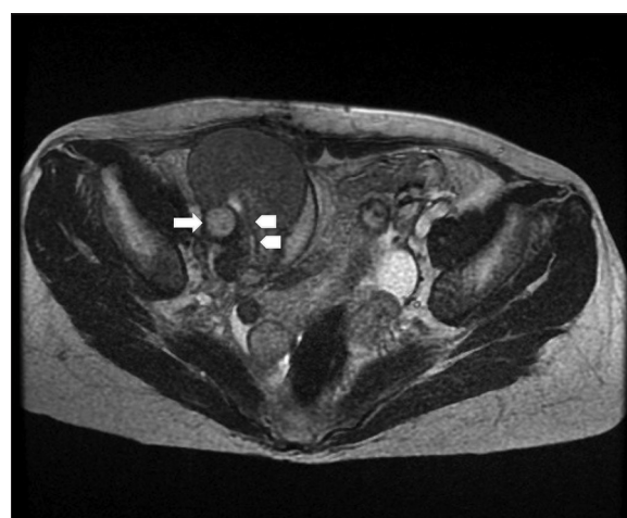
Figure 2: Noncontrast T2-weighted magnetic resonance imaging reveals a pseudoaneurysm (white arrow) with compression of the true lumen of the transplanted renal artery (white arrowhead), causing poor flow in the transplanted kidney

Patients with pseudoaneurysms after renal transplant are often asymptomatic and diagnosed incidentally [20,23]. Detecting infective pseudoaneurysm in the early course and starting immediate surgical treatment with antifungal medications are essential. Candida arteritis-related pseudoaneurysm or ruptures may progress rapidly in the early stage after transplantation [11,35,37,40]. This finding is different from that of those with chronic rejection-related transplant arterial pseudoaneurysm, which may be associated with a delayed course and relatively slow progression [40]. One report suggested that 2-week preemptive prophylaxis with antifungal agents can effectively prevent delayed vascular complications in patients with donation-after-cardiac-death kidney transplantation complicated by fungal infection-related hemorrhage [46]. Elimination of C. albicans is required to prevent possible arterial complications.