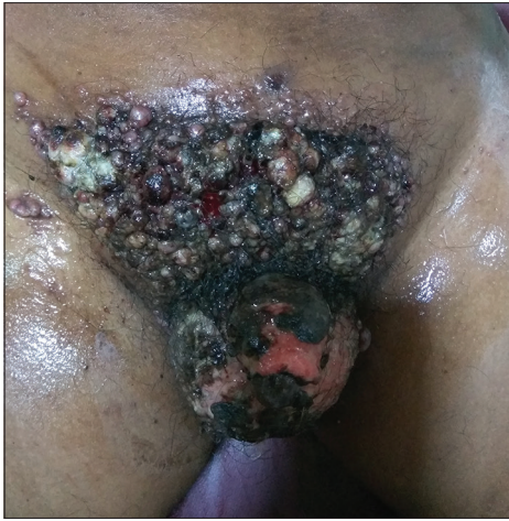
Figure 1: Multiple skin nodules over the pubic area with excoriation of the penile skin