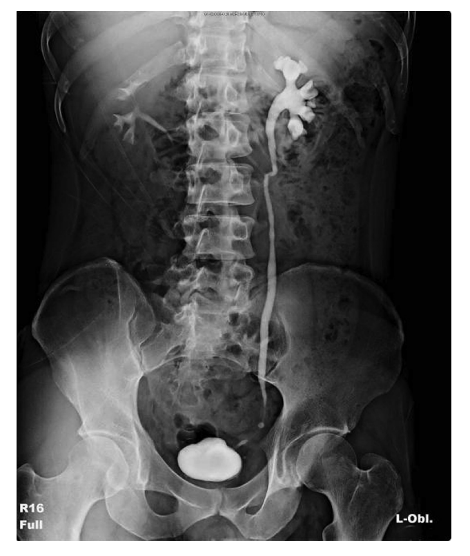
Fig. 1. Intravenous urogram shows left hydronephrosis and hydroureter. The left distal

Chronic ketamine abuse is known to cause upper and lower urinary tract destruction [1–6]. Lower urinary tract symptoms occur in about 20–30% of ketamine abusers [4]. The pathological findings of ketamine-induced cystitis have been well-studied [5,6]; however, the pathology of ketamine-induced upper urinary tract damage is rarely reported [7,8]. We found a case report of chronic recreational ketamine abuse with renal failure which mentioned ureteral histologic findings with florid nephrogenic metaplasia and