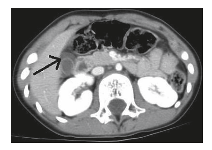
Fig. 1 — Computed tomography reveals a suspected hematoma (arrow) in the left hepatic lobe adjacent to the gallbladder fossa.

kidneys. A bilateral tube thoracostomy with a 20-Fr chest tube was performed under light, short-action sedation. The patient was febrile and exhibited tachycardia during observation in the intensive care unit with persistent abdominal pain and lethargic consciousness. Physical examination revealed a diffusely tender, distended abdomen. The white blood cell count increased to 12,150/mL. Because of peritoneal signs and unstable vital signs, magnetic resonance cholangiopancreatography was carried out for further evaluation of hepatobiliary injury before surgery to rule out other intra-abdominal lesions. However, liver laceration with hematoma in the left lobe of the liver and traumatic pancreatitis could not be excluded on MRI (Fig. 2). Laparoscopy was considered under suspicion of a hidden lesion causing peritonitis. During the exploration, a hematoma over the peri-gallbladder was found, and no active bleeding was noted. The duodenum was intact. The lesser sac