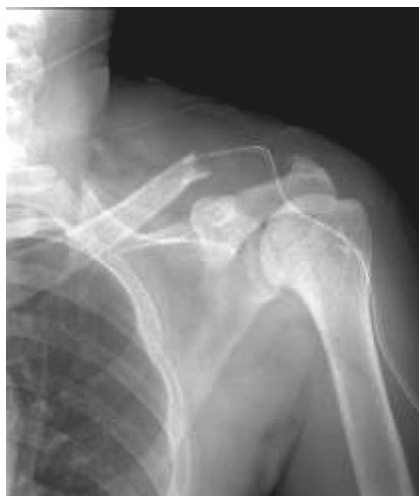
Fig. 3 — The mass and distal end of the clavicle were excised.