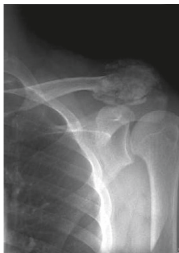
Fig. 1 — Plain radiography of the left shoulder shows a large periarticular mass with heterogeneously calcified density and bony erosion around the left distal end of the clavicle.

After the operation, a nephrologist adjusted the medical and hemodialytic regimens for the patient. The dialysate was changed to a low calcium form and the intake of calcium supplements, high-calcium foods, and vitamin D were restricted. In addition, aluminum-hydroxide antacid was used to derivate the phosphate. After 3 months of management, the patient's blood calcium, phosphate, and parathyroid hormone levels returned to within reference ranges.