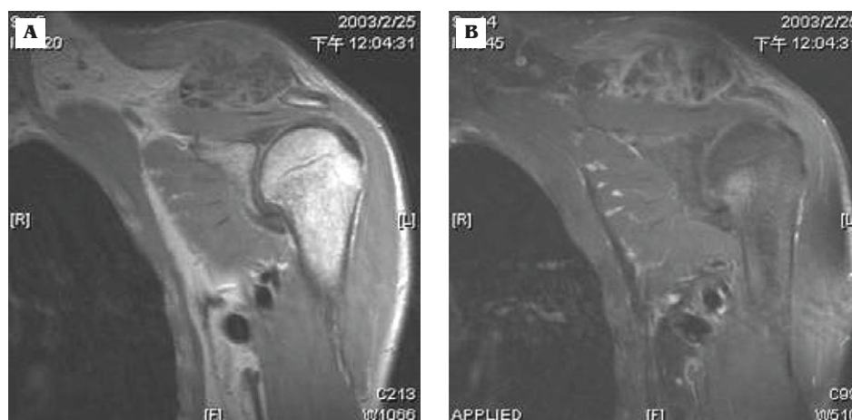
Fig. 2 — Magnetic resonance imaging shows a tumor with heterogeneous consistency and multiple cavities alternating with a calcified area: (A) coronal T1-weighted; (B) coronal T2-weighted.