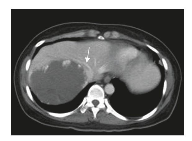
Fig. 1 — Huge mass with peripheral enhanced nodularity occupying nearly all of segments 7 and 8 and extending to segments 5 and 6. The inferior vena cava is compressed to the medial aspect by the mass. The right hepatic vein cannot be clearly seen here. The middle hepatic vein is very close to the mass (arrow).