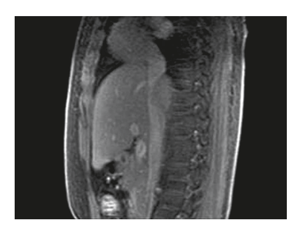
Fig. 2 — Magnetic resonance imaging, sagittal view, shows the location of the tumor and the inferior vena cava (IVC). The tumor is encircling the IVC with extension to the posterior aspect of the IVC and near the orifice of the hepatic vein.

data revealed that the blood count and liver function test results were within reference ranges. Hepatitis B virus and hepatitis C virus markers were negative, and \alpha -fetoprotein level was 14.56 ng/dL (reference range, 0–10 ng/dL).