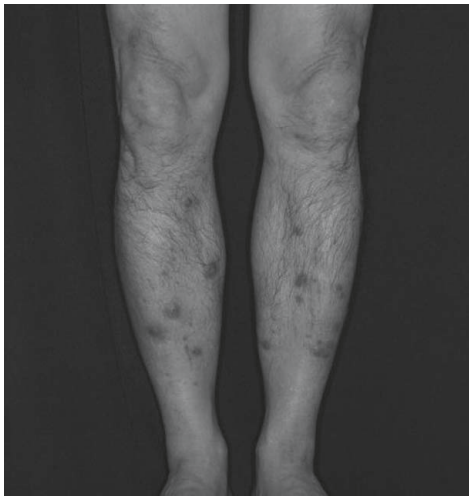
Fig. 1 — Multiple erythematous papules and nodules over the lower legs, which had been immersed in the Mu-Gua River.

clinic of Buddhist Tzu Chi General Hospital, his skin lesions were diagnosed as prurigo or insect bites and treated with a topical steroid ointment and oral antihistamines. However, the skin lesions and symptoms persisted. Therefore, a skin biopsy was performed on the lesion. The histological examination revealed intensive eosinophil and lymphocyte infiltration of the dermis and some larval sections were identified within the biopsy (Fig. 2). All the symptoms resolved spontaneously 3 weeks after infection. On the basis