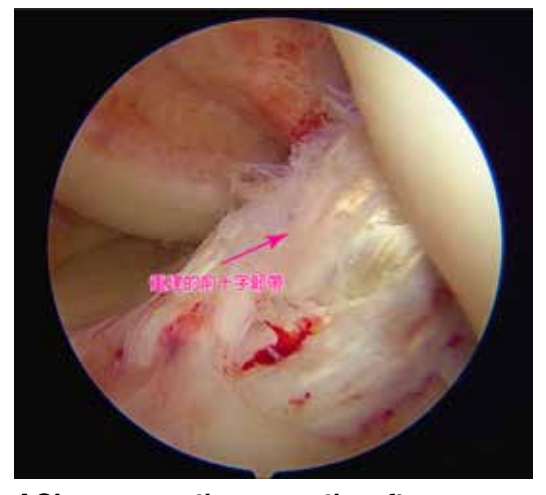
ACL recovery three months after surgery.

three months, it was confirmed that his ligament was fully repaired and recovery was normal, but it was also detected that significant muscle atrophy was present in his right leg. With a view to preventing future impacts on his work