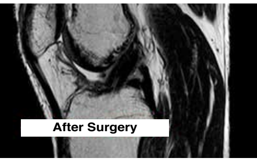
MRI images of the ACL taken before and three months after surgery clearly show the recovery process.