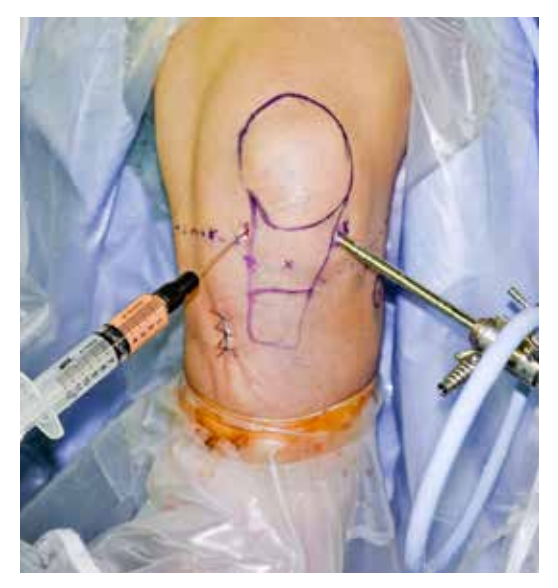
ACL recovery can be accelerated with Stromal Vascular Fraction (SVF) cell treatment (shown in the image)