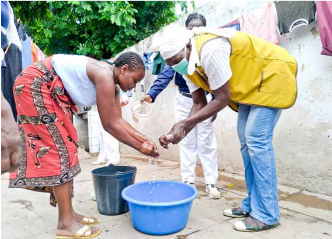
In many places, personal hygiene is inexistent. The volunteer team entered the communities and visited house by house for the promotion. The picture shows the local people practiced hands washing by following the volunteers.

quarantining, and how to prevent infection. He demonstrated on the spot the correct handwashing techniques; how to cough effectively into the elbow to reduce spread. Every volunteer worked hard during the live training.