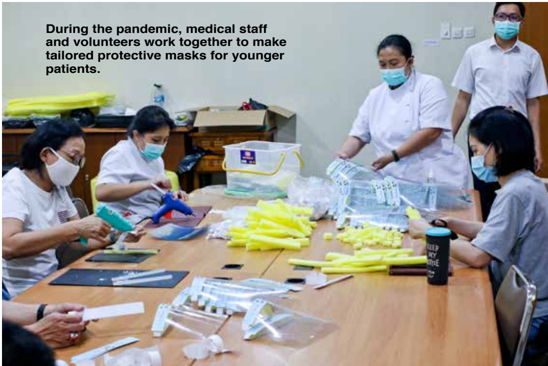
During the pandemic, medical staff and volunteers work together to make tailored protective masks for younger patients.

epidemic, the hospital actively took various preventive measures. He said, “Everyone, including patients, entering the hospital must wear face masks. Because it’s found that many children feel uncomfortable when wearing masks a long time, we specially tailored protective masks for children and infants in order to provide an extra layer of protection.” In addition, the seats in the waiting area were also spaced out more to maintain social safe distance.