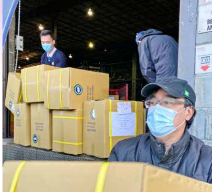
China Airlines Cargo Services opened another express cargo pickup area for Tzu Chi volunteers to avoid the delay.