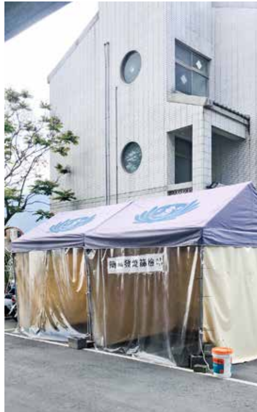
In February, Kuanshan Tzu Chi Hospital built new tents for a basic fever testing station.

To control the pandemic, Kuanshan Tzu Chi Hospital set up temperature checks at the atrium and emergency department entrance. The wearing of masks was strongly promoted for all staff entering the hospital, hand sanitizers were placed at entrances, and the number of visitors to wards and people accompanying patients was also restricted. These multiple measures were placed to try and reduce infection risk. At the early stages of promotion, the