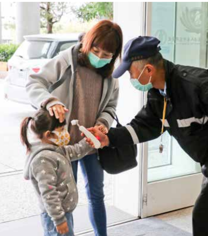
Taichung Tzu Chi Hospital restricted access at entry points, requiring masks and temperature checks to enter and leave the hospital.

In accordance with the COVID-19 pandemic regulations from Centers for Disease Control at the Ministry of Health and Welfare, Taichung Tzu Chi Hospital instated access restrictions for safety. Temperature testing, mask wearing, and hand sanitization measures were also increased in light of the pandemic.