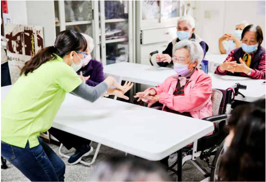
The Geriatric and Community Medicine Unit of Hualien Tzu Chi Hospital headed to Ji Gong Neighborhood to educate the elderly members of the community on pandemic prevention.

colleagues, administrative colleagues, Tzu Chi volunteers, and accompany family members from the community all rolled up their sleeves to “donate blood and share love”, hoping to generate bags and bags of blood to replenish supplies.