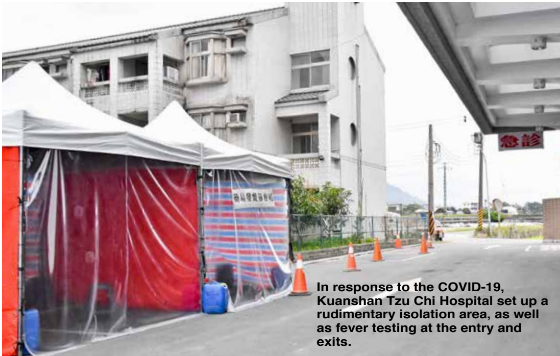
In response to the COVID-19, Kuanshan Tzu Chi Hospital set up a rudimentary isolation area, as well as fever testing at the entry and exits.