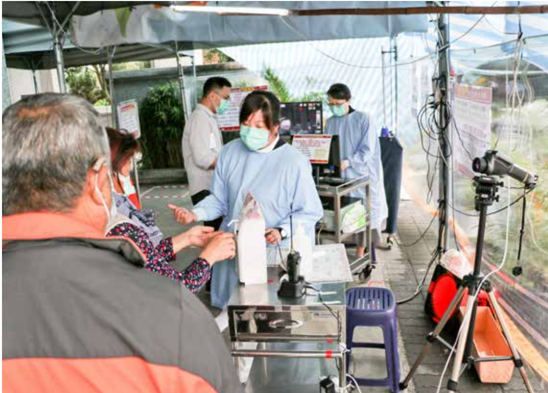
The spread of the pandemic led to increased prevention strategies, and Yuli Tzu Chi Hospital applied masks, temperature checks, hand hygiene and associated checks to every person entering the hospital.