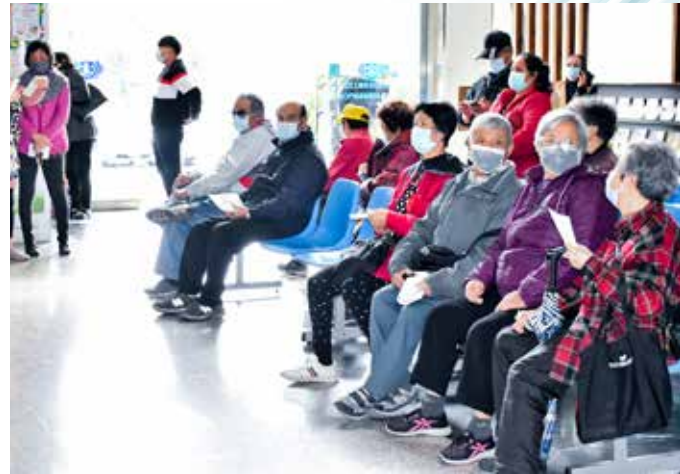
Through promotion, Kuanshan community members all adhered with hospital standards of wearing a mask when attending hospital.