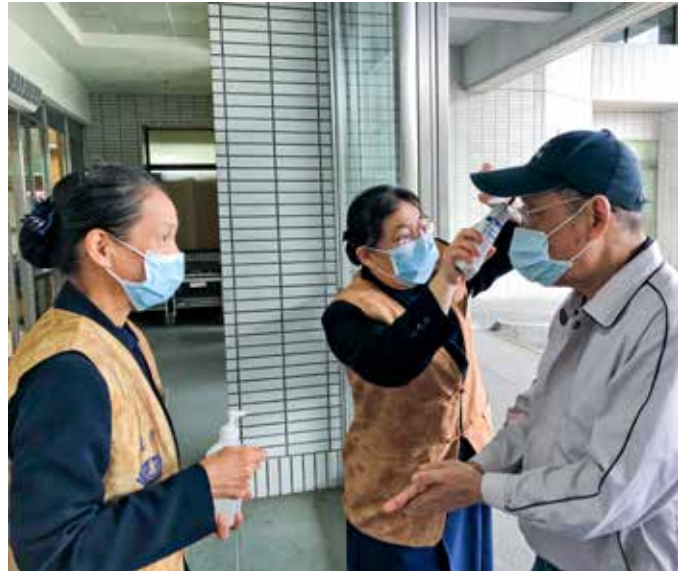
Healthcare volunteers helping take temperatures and sanitize hands at the atrium of the clinics.

With confirmed cases gradually appearing in Taiwan, on January 24th Chinese New Year Eve, the Centers for Disease Control announced increased measures for the pandemic, and Hualien Tzu Chi Hospital held an emergency meeting and decided that, from Chinese New Year Eve, all people entering the hospital must wear masks, and any visitors or family members with fever or respiratory systems would not be allowed to enter hospital rooms. All patients would be restricted to two family members or visitors, and there would be restrictions to hospital access, with a fever testing station staffed 24 hours a day by a roster of volunteers, and hospital nursing and security staff to check the temperature of all those entering the hospital. If any people were found to have a fever or respiratory systems, they would be directed to attend for medical attention at the emergency department.