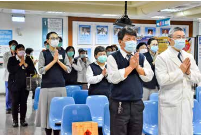
From April 23rd, 2020, Kuanshan Tzu Chi Hospital began a charity movement, with the love proceeding towards eliminating the pandemic.

general public were initially not used to the measures, but gradually they were all able to follow the regulations and comply with the hospital's infection prevention.