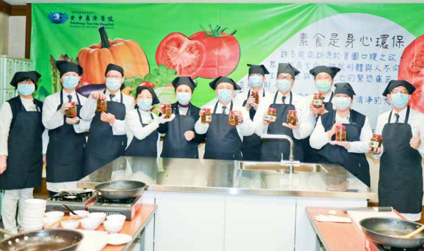
The Chinese Medicine Department of Taichung Tzu Chi Hospital making a “Healthy Blessing Drink” for colleagues in the hospital, as well as distributing the medicinal herbs to medical volunteers that were unable to come to the hospital.