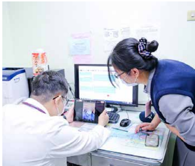
On February 17th Hualien Tzu Chi Hospital began using telehealth. Doctors can give medical advice through video calls on tablets or through telephone for those quarantining at home that need medical attention or those requiring tests.