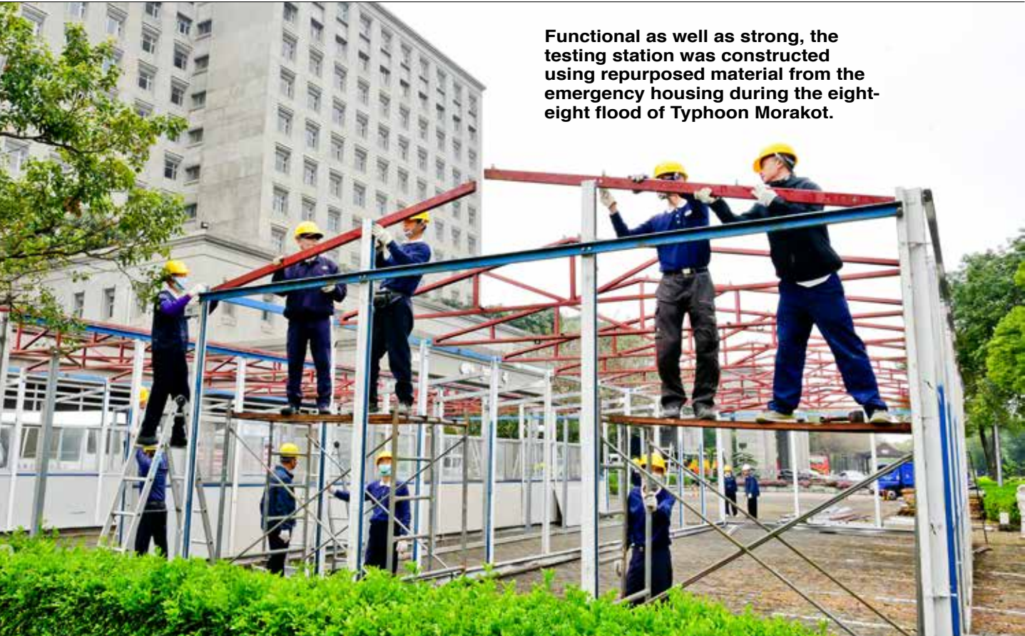
Functional as well as strong, the testing station was constructed using repurposed material from the emergency housing during the eight-eight flood of Typhoon Morakot.

their administrative building was under reconstruction.