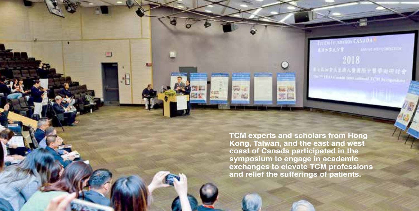
TCM experts and scholars from Hong Kong, Taiwan, and the east and west coast of Canada participated in the symposium to engage in academic exchanges to elevate TCM professions and relief the sufferings of patients.

experts invited from Hong Kong, Taiwan, and the west and east coast of Canada. The first two days of the symposium were dedicated to the academic presentations by the 22 experts, and the last two days were organized for specialized, in-depth seminars on specific topics. A total of 200 attendees and over 230 volunteers and lecturers participated in this event, working together to facilitate academic exchange with the aim to enhance TCM profession and relief patients' suffering.