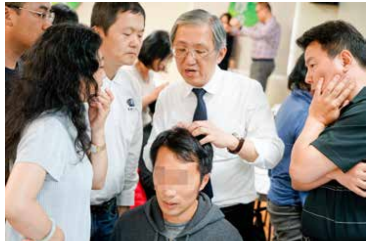
The 7th TIMA Canada International TCM Symposium was held in Humber College, Toronto from Oct. 5 to 8, 2018. On the first day of the symposium, the Tzu Chi Clinic of Traditional Chinese Medicine on Humber’s campus was completed.