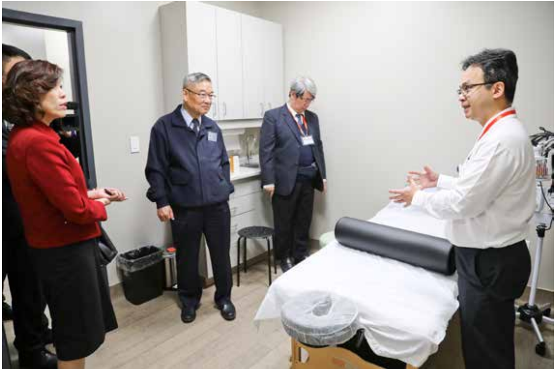
On Oct. 6, the symposium attendees visited the Tzu Chi Clinic of Traditional Chinese Medicine on the campus of Humber College to learn about its space configuration.