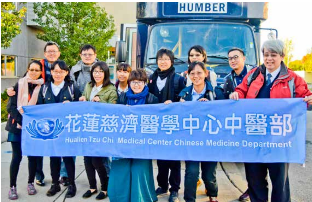
Hualien Tzu Chi Hospital and Kuanshan Tzu Chi Hospital TCM doctors deliver their clinical report and themed poster exhibition.

of the TCM clinic inside the campus, which would be managed and operated by Tzu Chi Canada, had just begun. The Tzu Chi Clinic of Traditional Chinese Medicine in Canada will continue to work closely with Humber College to develop a comprehensive TCM program that would serve as a foundation for TCM-oriented TIMA Canada, and to promote and integrate TCM into the system of Western Medicine, while simultaneously provide health care to underprivileged communities such as the aboriginals, new immigrants, and low income families in the spirit of human-oriented medicine and selfless love.