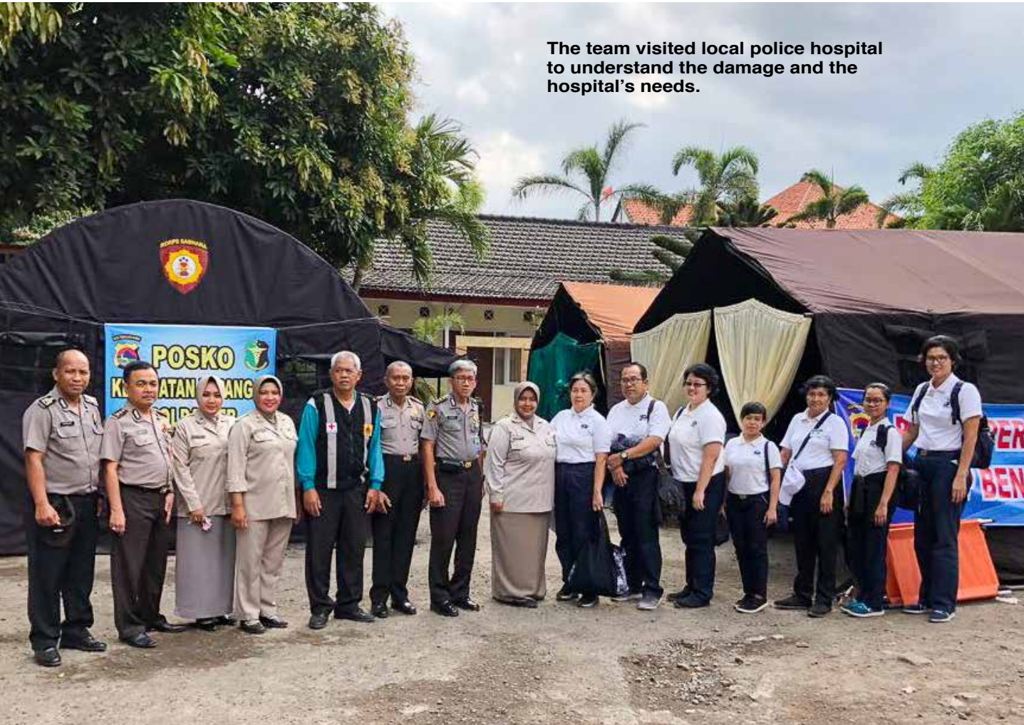
The team visited local police hospital to understand the damage and the hospital's needs.