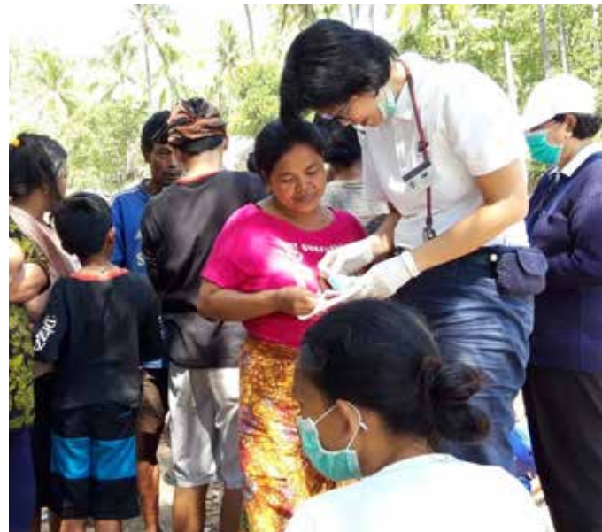
The medical team performed a free clinic at Tempos.

Volunteers also brought some supplies to help the relief effort and surveyed the disaster village Budhis. Then they arrived at Tanhung, and saw the hospital buildings damaged with many cracks and made uninhabitable. They found that all the community hospitals in Tanjung were badly damaged; only a few buildings were operable. Because the general hospitals in the cities of North and East Lombok