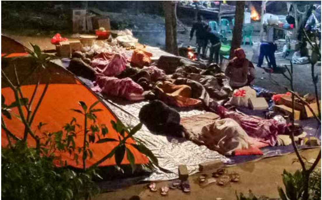
The night was cold with many aftershocks; residents camped outdoors in sleeping bags.