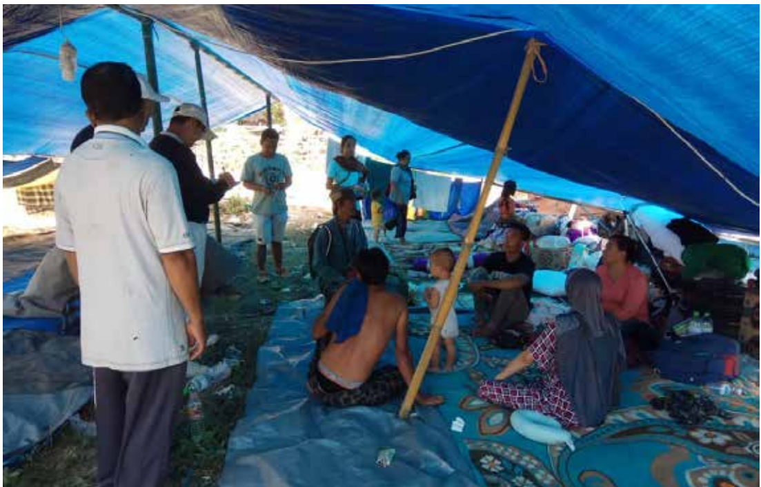
The volunteers showed their concerns to those who temporarily stayed in the camps behind the Jaya Wijaya Buddhist temple.