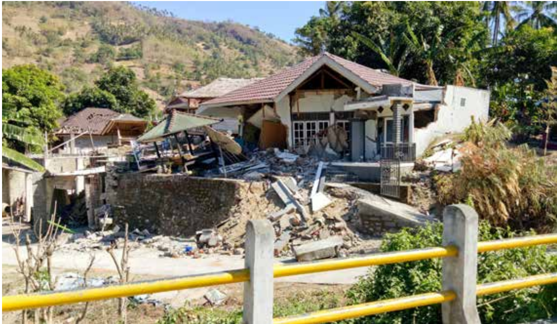
August 8, the team went to Tanjung Pamenang and nearby areas to survey the damage.

starting a relief effort, so he came happily and joined the relief effort from 12 miles away.