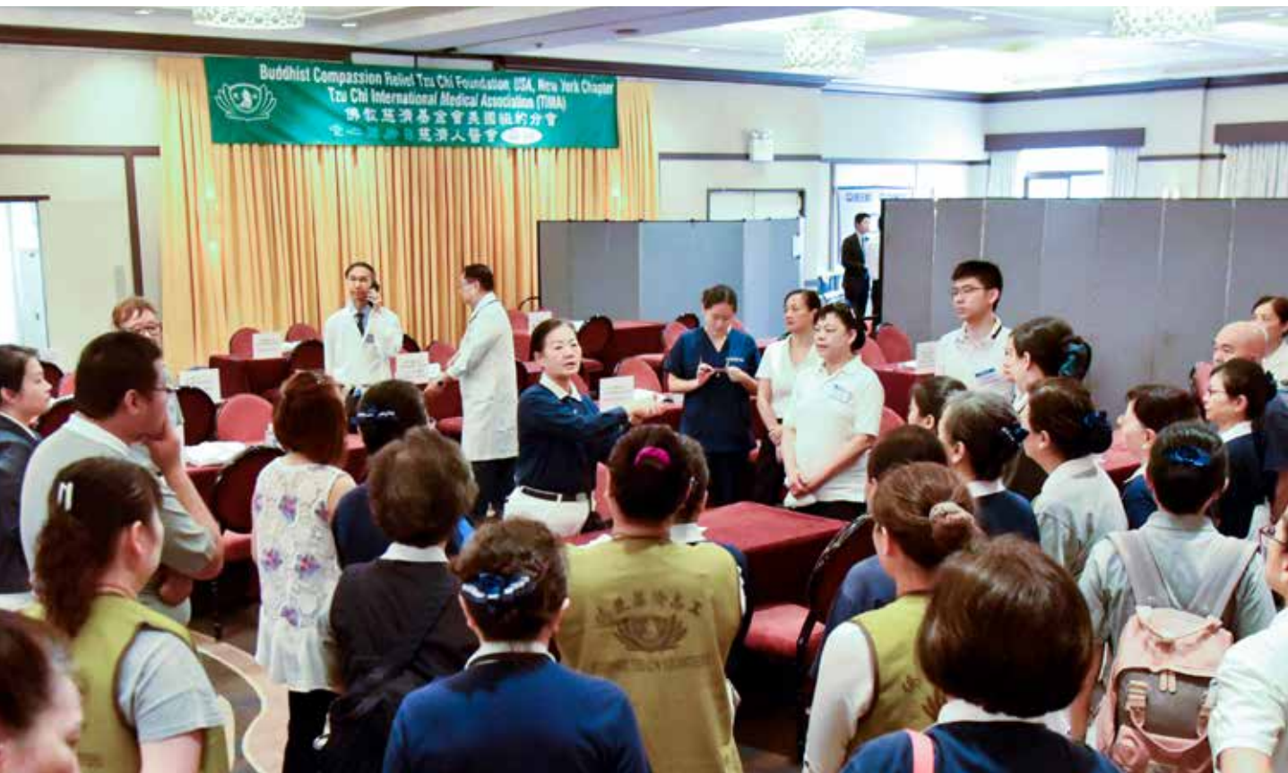
Tzu Chi NY branch, volunteers and medical team held a health day free clinic, people paid attention to the matters prior to the opening of the clinic.