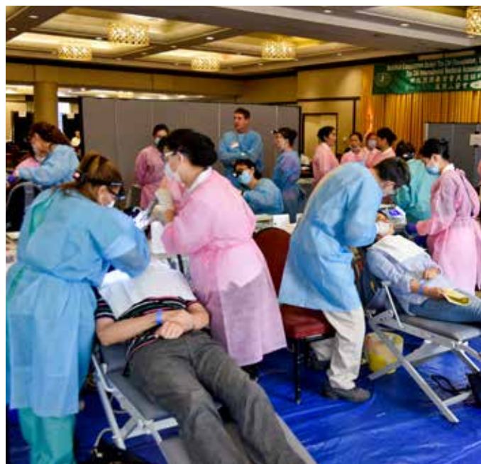
The dentist's team provided the services for teeth cleaning and extraction.