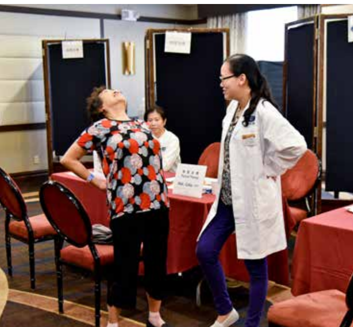
Physical Therapist helped people to do stretch exercises