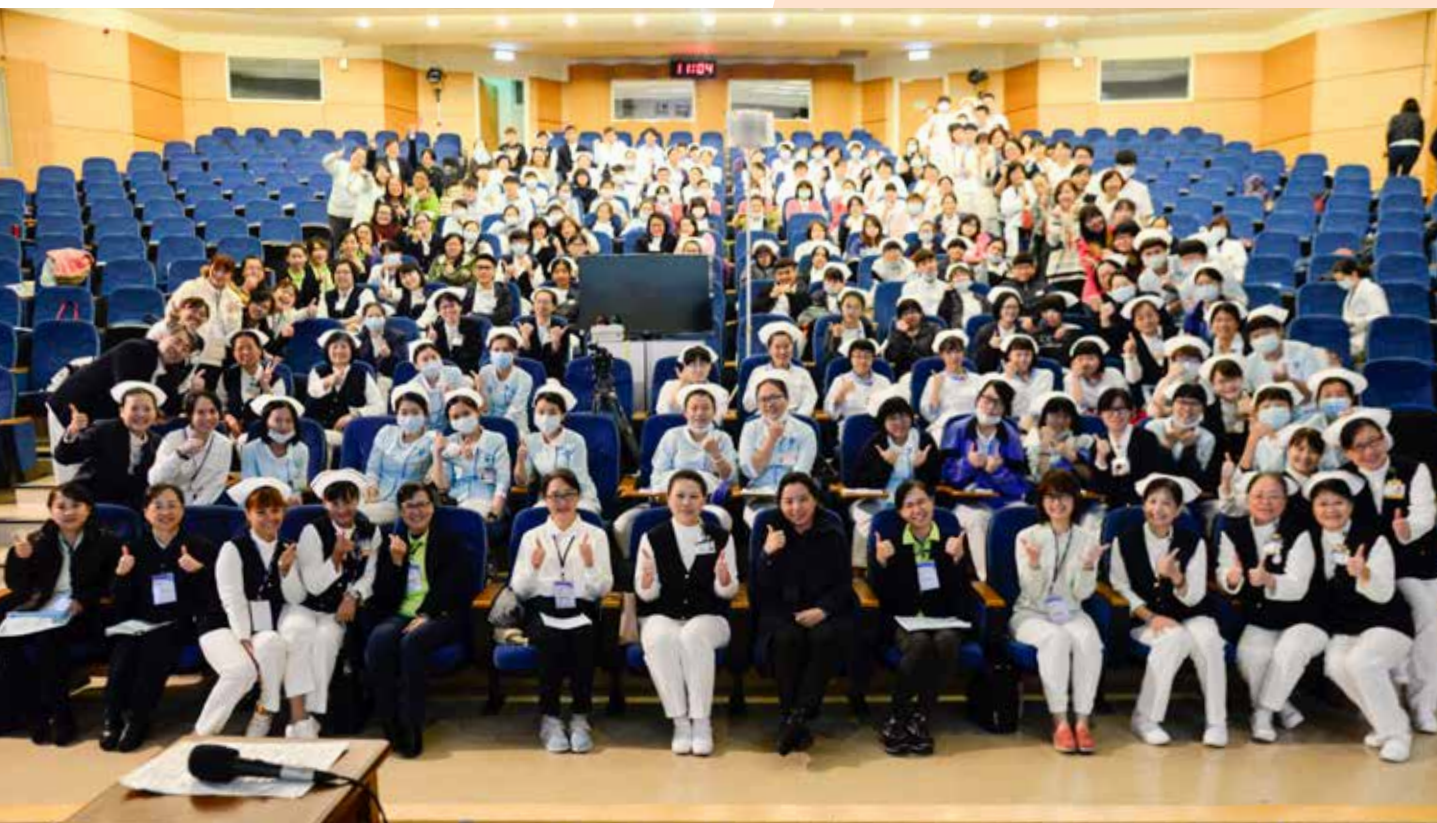
Six Tzu Chi Hospitals nursing representatives get together at Dalin for oral presentation of figure map narrative competition.

A stage play describing a couple’s story was shown by our nurses. The husband said: “How did I get such a disease?” The wife answered: “I can’t believe that you are suffering from such a disease.” “But I want to live, I don’t want to go through the terrible procedure of dialyses ...” This was the oral presentation of