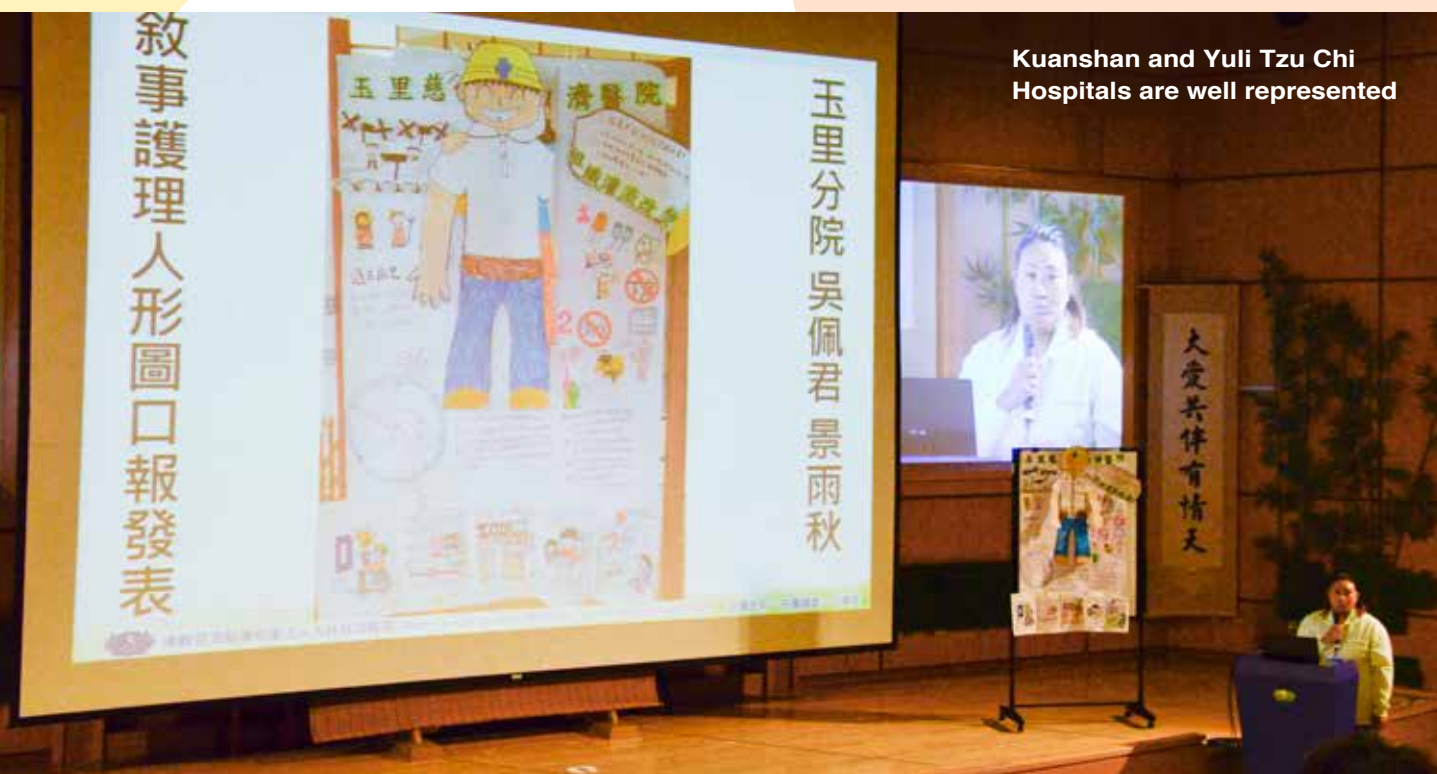
Kuanshan and Yuli Tzu Chi Hospitals are well represented

hospital all sent their specialists for presentation. There were a total of eleven story telling presentations.