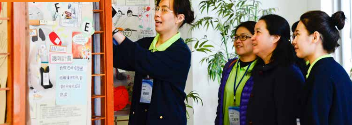
Six Tzu Chi Hospitals figure maps lively exhibits