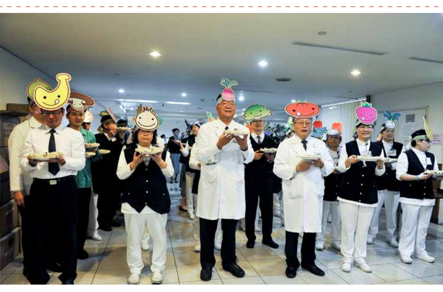
Tzu Chi Hospitals would hold events to promote plant-based diet.

Therefore, I went beyond imagination and thought of this special way - "Food burial." After my body is cremated, my ashes will be served as food among friends who come to my funeral.