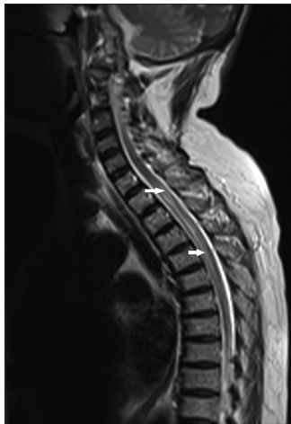
Figure 1: Increased T2 signal intensity in the spinal cord at the T1 to T6 level (arrow), compatible with a contiguous inflammatory lesion of the spinal cord

complement and neutrophil elastase inhibition, and the blockers of AQP4-IgG binding to AQP4 [9,11-13].