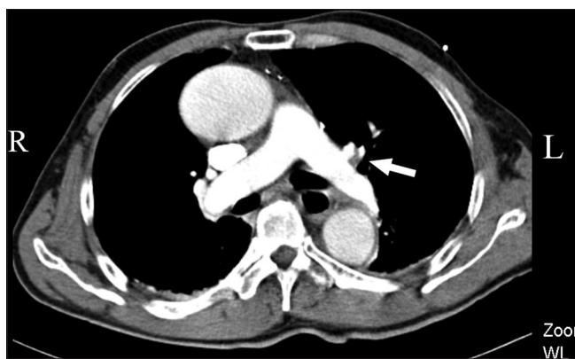
Figure 1: Chest computed tomography scan revealed a filling defect in the apical posterior branch of the left pulmonary artery (arrow), indicating pulmonary thromboembolism

The patient's hemodynamic profile destabilized (BP 70/50 mmHg and HR 120 beats/min) after tracheal intubation, but improved after using an inotropic agent (dopamine 5 mcg/kg/min). The operative procedure was postponed, and the patient was transferred to the Intensive Care Unit (ICU) for monitoring and stabilization. A series of diagnostic workups revealed that the cardiac enzyme (creatinine kinase-MB and troponin I) levels were within normal ranges, whereas D-dimer levels were significantly increased (>35200 µg/L). Chest computed tomography (CT) scan confirmed embolism of the left pulmonary artery [Figure 1]. Impedance plethysmography was performed and the result indirectly indicated the presence of left lower leg venous thrombosis [Figure 2]. Considering his hemodynamic stability as well as the episodes of upper gastrointestinal bleeding and hematuria during his postoperative stay