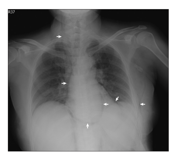
Figure 1: Chest radiograph reveals subcutaneous emphysema over the left chest wall with gas accumulation in the mediastinum extending to the right side of the neck (arrows)

the pulmonary system and the esophagus causing air leakage into the mediastinal space are the most common causes of pneumomediastinum [2]. In rare circumstances, gas originating in the retroperitoneal space can spread to the mediastinum. Retroperitoneal causes of pneumomediastinum include perforation of a duodenal ulcer, ulcerative colitis, colonic diverticulitis, and procedures such as sigmoidoscopy, colonoscopy, and barium enema [4]. Regardless of the localization of air leakage in the retroperitoneal space, pneumomediastinum initiated by urinary tract disorders or endourology surgery is uncommon. In 2004, Wang et al. reported a case of pneumomediastinum caused by emphysematous pyelonephritis. When retroperitoneal air produced by bacteria in an infected kidney reached a certain pressure threshold, it could migrate into the mediastinum [5]. Pneumomediastinum after laparoscopic urologic surgery is not unusual and is more common after retroperitoneal procedures compared with transperitoneal laparoscopy (30% vs. 4.6%), due to lack of a subdiaphragmatic peritoneum [6].