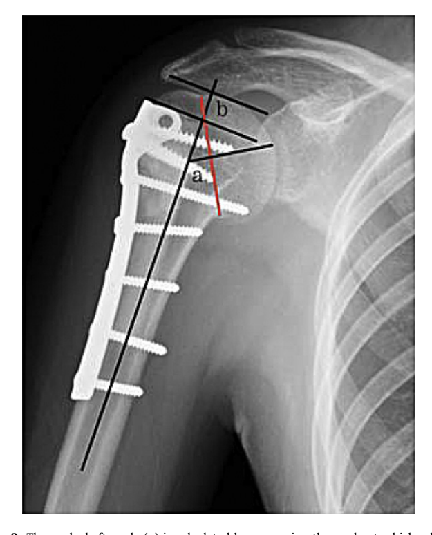
Fig. 2. The neck-shaft angle (a) is calculated by measuring the angle at which a line drawn on the central axis of the humeral shaft intersects with a line perpendicular to the orientation of the anatomic neck of the humerus in the shoulder external rotation view. The humeral head height (b) is interpreted as the distance between the top of plate and the top of the humeral head using the axis of the humeral shaft as the reference.

Data were expressed as either case numbers or mean \pm standard deviation. Student t test was applied to compare the means of continuous variables. Categorical variables were analyzed using the Chi-square or Fisher's exact test. Statistical significance was defined