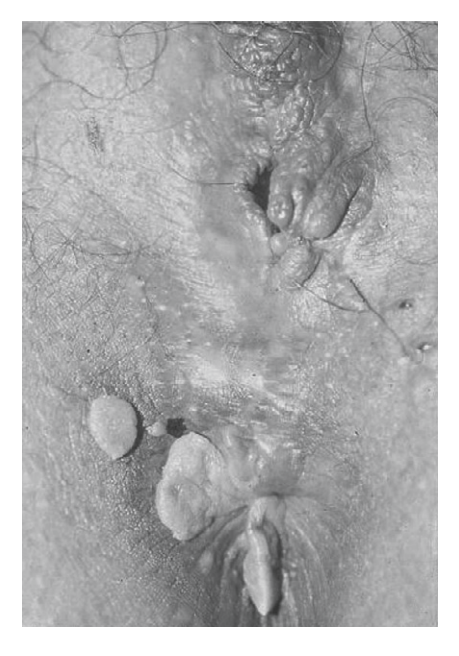
Fig. 1 — Plaque-like condyloma latum in the perineum.