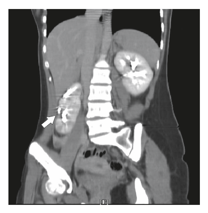
Fig. 2 — Horizontal reconstruction image of an abdominal computed tomographic scan in the oblique plane demonstrates the right ectopic kidney (arrow).

Another female patient, aged 22 years, presented at our emergency department with fever and right lower quadrant abdominal pain for the previous 12 hours. She had initially felt vague abdominal pain, which was later localized to the right low quadrant abdomen and was accompanied by nausea and urinary frequency. On physical examination, her body temperature was 38.1°C. Right lower quadrant and rebounding tenderness without costovertebral tenderness were noted on physical examination. Laboratory examination revealed her peripheral white blood cell count to be 10,700/mm<sup>3</sup> and her serum creatinine was 0.77 mg/dL. Urine analysis revealed 15–20 white blood cells